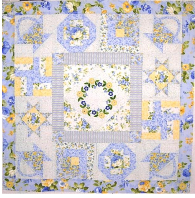
Rose Blossom Sampler – 45" Square Pattern $10.00 Wool Kit $20.50 Requires 11 <sup>1</sup>/<sub>2</sub>" square of Background Fabric.

Bountiful – 25" square Pattern $12.00 Wool Kit $45 Requires 12 ½" Background Fabric