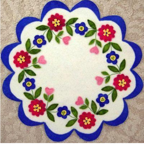
Scalloped Wreath of Blooms Instructions included. $38.00