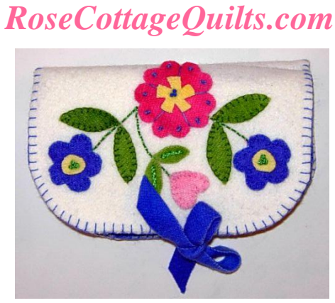
Whimsical Needle Nest $18.50 Instructions included.