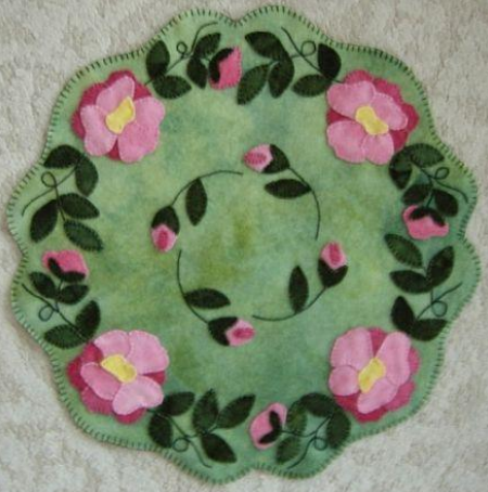
Wreath of Roses $36.00 Rose Needle Nest $22.50 Both include instructions.