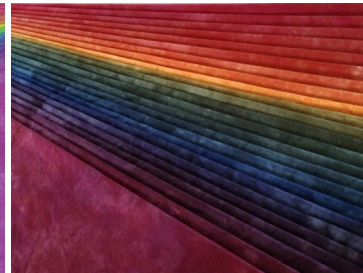
Vineyards & Vistas

Tuesday, April 14, 2015 9:00 a.m. – 4:00 p.m.