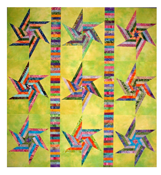
Supply List: Bring an assortment of fat quarters or 1/4 yard pieces of fabrics (10 to 15 fabrics) in your choice of colors (select light, medium and dark values), you could also bring some large scrap pieces of fabric and a yard of background fabric if desired, a drafting ruler (I like the Quilter's See-Thru Drafting ruler), 1/4 inch graph paper, colored pencils, scissors, neutral color piecing thread, pins, medium size rotary cutting mat with ruler and rotary cutter, sewing machine with extension cord, iron and ironing pad.