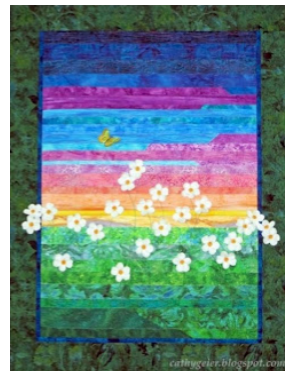
Figure 2: Summer Dreams: Cathy Geier