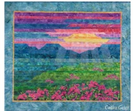
Figure 3: Pink Azaleas at Sunset: Cathy Geier