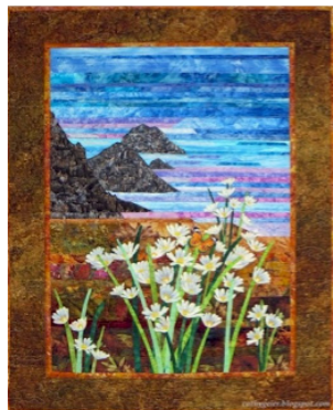
Figure 1: Wildflowers by the Sea; Cathy Geier