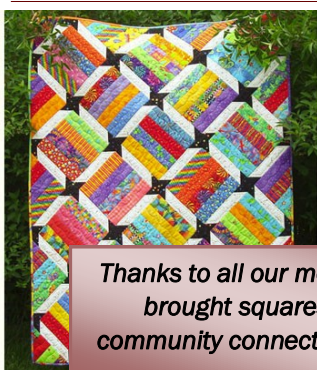
Thanks to all our members who brought squares for our community connections project.