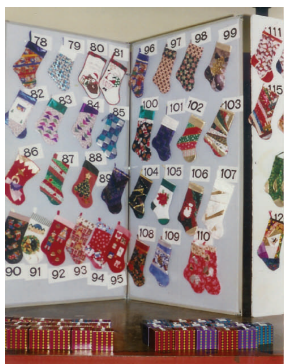
Stocking Display for Viewers' Choice Awards Vote is by Monetary Donation

and/or Christmas, especially those children most recently brought into protection at holiday-time. We also serve as many children under protection as possible over the holiday. We do that with the generous support, talent and resources of our guild and its members. We make Christmas Stockings, provide holiday gifts and raise funds—all for the benefit of the kids under protection in Douglas and Sarpy counties. We do this in cooperation with the Nebraska Department of Health and Human Services and Child Protective Services. In order to accomplish all this, we have a fund-raiser gala & party at our regular December meeting.